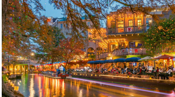
Fiesta de las Luminarias in San Antonio