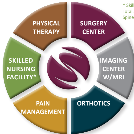
OSI Appleton Campus

* Skilled nursing facility for Total Joint Replacement & Spine Surgery