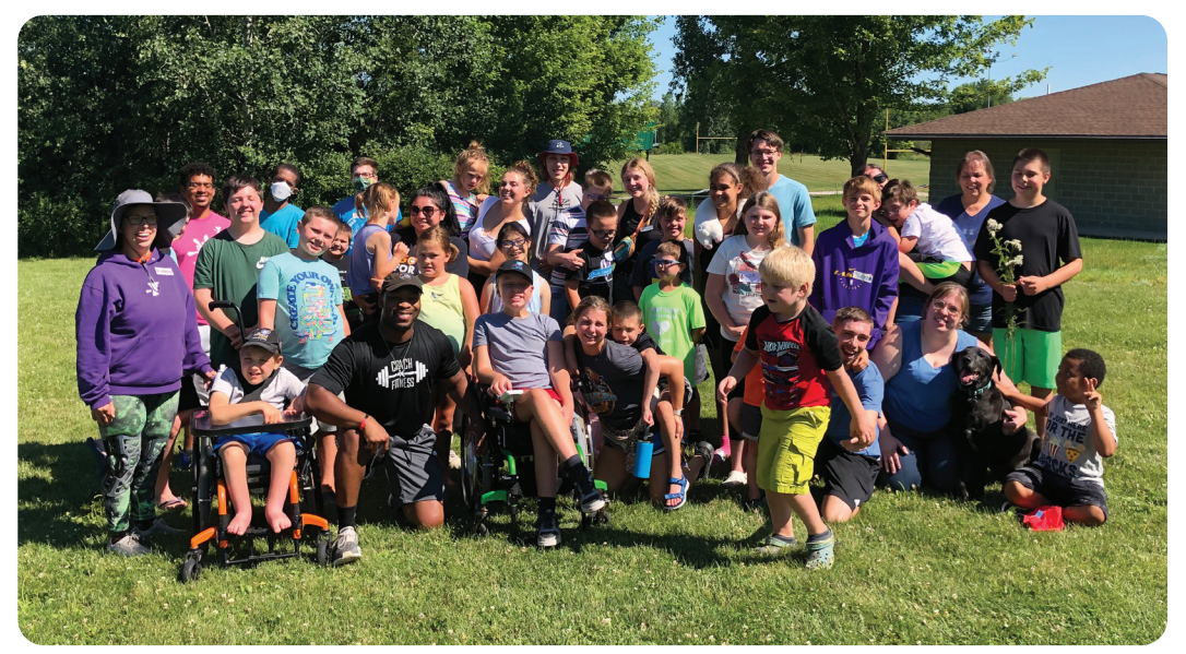
Camp is supported by the YMCA of the Fox Cities' Annual Campaign and United Way Fox Cities.

• There is a $35 non-refundable registration fee for each camp that must be paid at the time of registration.