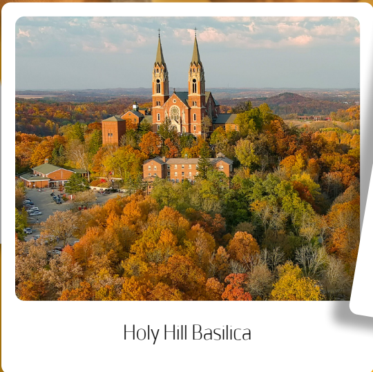
Holy Hill Basilica